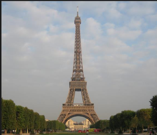
St. Basil's Cathedral

It is shaped like flames, though many of the towers look like colourful ice cream cones.