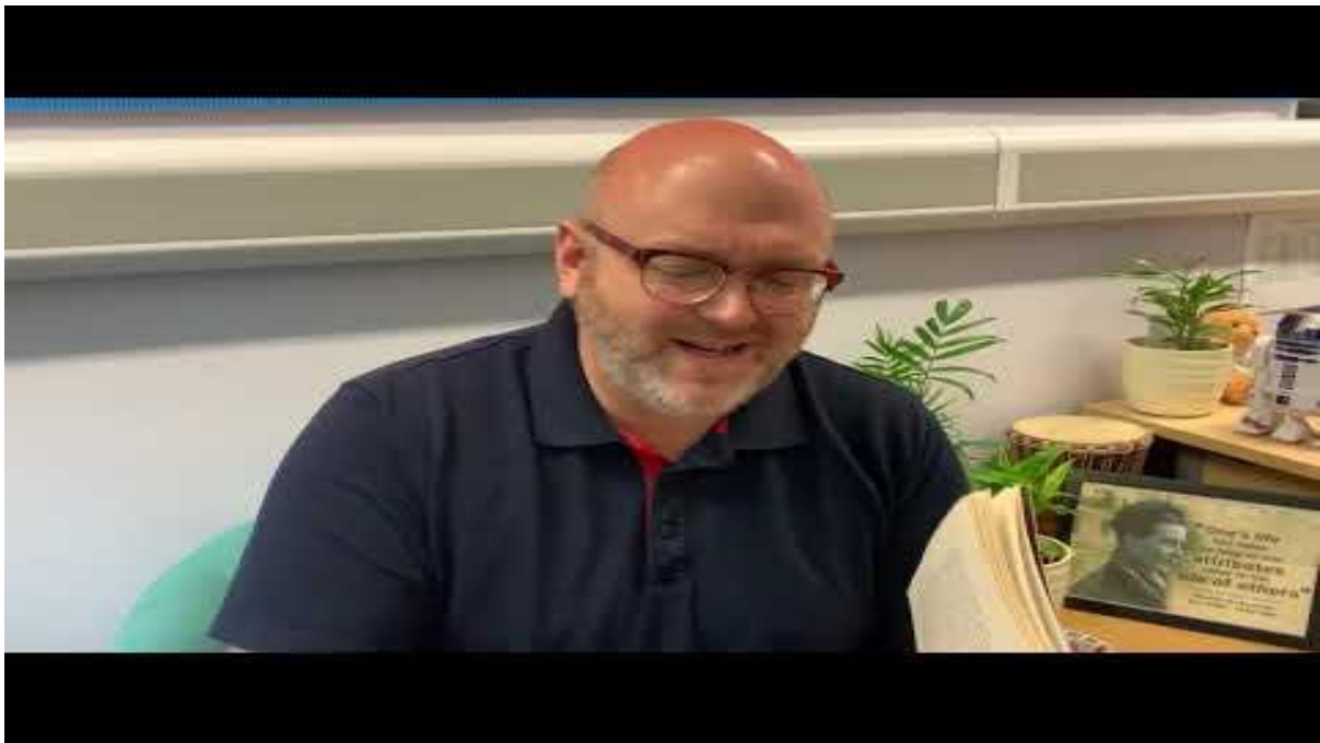
The Firework Makers Daughter Chapter 3 part 1