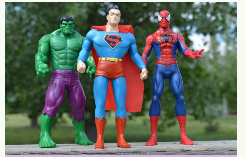
Ready for action, Superman (wearing his trademark red cape) called his friends to join him in the fight against evil.